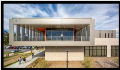
Public Safety & Allied Health, CHC Sustainability: LEED Silver Certified

The 46,937 square foot facility houses the emergency medical services and paramedic program, fire academy, drill yard, and spray wall at the eastern portion. This building replaced the old Educational Occupation 2 Building.