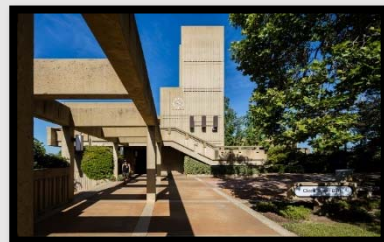
Student Services A Renovation Campus: Crafton Hills College

Renovated the existing concrete structure of the laboratory /administration building, including a complete replacement of mechanical, electrical, plumbing and data systems, windows and roof replacement. The building was brought up to current seismic, access and fire/life safety codes.