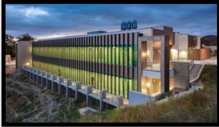
Canyon Hall, CHC Sustainability: LEED Gold Certified

The new 36,000 square foot facility utilizes contextual design and is separated into two buildings connected by a bridge at the second floor. There is a state-of-the-art exterior façade of metal and precast panels, and glass window walls. The building includes teaching labs, support spaces, lecture halls, faculty offices and an outdoor amphitheater. The building received the 2016 architectural portfolio's outstanding design (specialized facility) by American School & University.