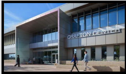
Crafton Center, CHC Sustainability: LEED Gold Certified

The new 46,500 square foot, steel framed, Type-II building houses all campus student services including administration, a health center, bookstore, and food services. It is a two-story building at the edge of formal central campus quadrangle. The building engages the Living Wall, an iconic landscape feature.