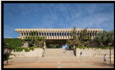
LADM Renovation, CHC

Renovated the existing concrete structure of the laboratory /administration building, including a complete replacement of mechanical, electrical, plumbing and data systems, windows and roof replacement. The building was brought up to current seismic, access and fire/life safety codes.